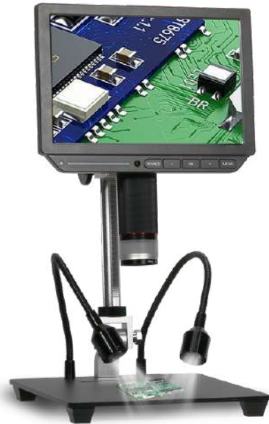
4K LCD Microscope